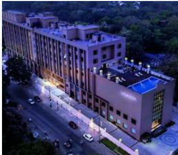
Vivanta by Taj