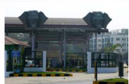
Tata Steel Zoological Park