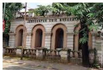
Jamshedpur Coin Museum