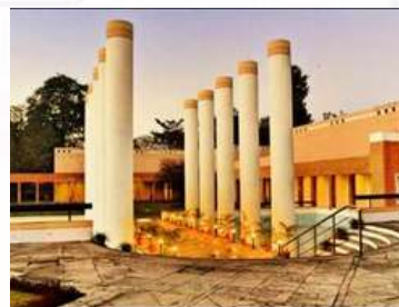
Russi Modi Centre for Excellence