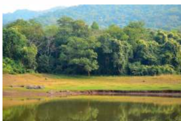
Dalma Wildlife Sanctuary