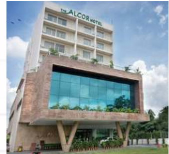
The Alcor Hotel