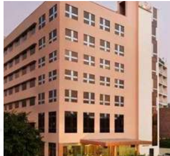
Ramada by Wyndham