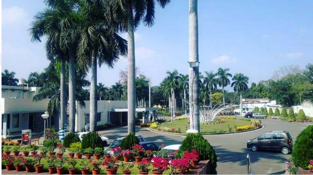
Tube Maker's Club

The Tubemakers club in Jamshedpur has a rich history that dates back to the early 20th century. Established with the aim of promoting camaraderie and sportsmanship among the employees of the Tubemakers company, the club has since evolved into a prominent social and recreational hub in the city. Over the years, it has played a pivotal role in fostering a sense of community and belonging among its members, organizing various cultural events, sports tournaments, and social gatherings. For conference participants visiting the venue, exploring the history and activities of the Tubemakers club can provide valuable insights into the local culture and traditions, as well as an opportunity to engage in recreational activities and social interactions.